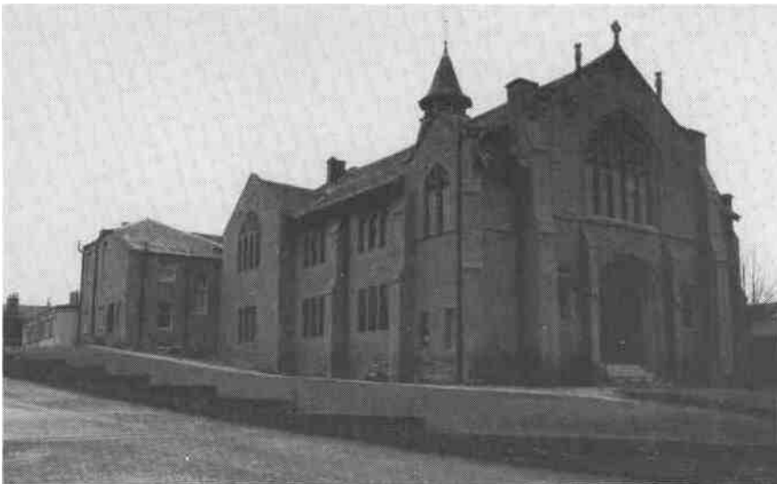
Hamilton Baptist Church and Extension

Outreach from the Church is to be seen in Choir and smaller groups in deputation, Gospel Coffee Bars and campaigns, door to door visitation, work in Women's Auxiliary, Men's Fellowship, Youth Fellowship, Ladies' Bible Studies, Supper Clubs, Children's Clubs, Open Air work, Eventide Homes and last but not least, personal witness in word and in life, which God has been pleased to use to great effect in our situation.