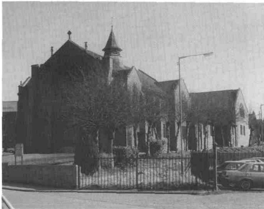
Hamilton Baptist Church with recently acquired area of ground